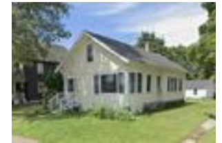
10 Summer St.

3/17, 10 Summer St. , 5-room Bungalow, 2 bed/1 bath, oak floors throughout, wood casings, wood doors, attic, full walk-out basement, detached 1-car garage, porch, shed, view of Number One Pond, intown, $305,000 (pictured right)