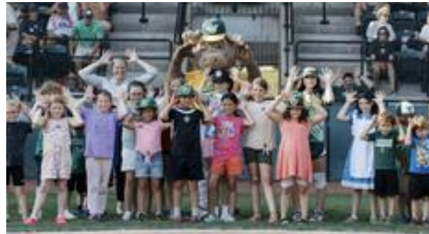
Past participants in the Boomer's Bookworms Literacy Program, sponsored by the Sanford Mainers.

A chance to grow at the Sanford Community Garden: Spaces are available at the Sanford Community Garden for interested gardeners to grow their own food. Everything needed for a successful harvest is provided free. Plus, Master Gardener volunteers are available for guidance and information. Submit your application for a garden plot before April 12. The garden is a project of the Sanford Springvale Mousam Way Land Trust with generous support from Kennebunk Savings. To apply: https://tinyurl.com/4ea7ytwj