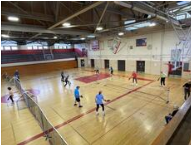
The Memorial Gym's pickleball courts are usually busy.