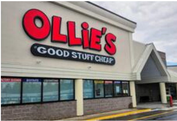
The new Ollie's store is set to open May 1.