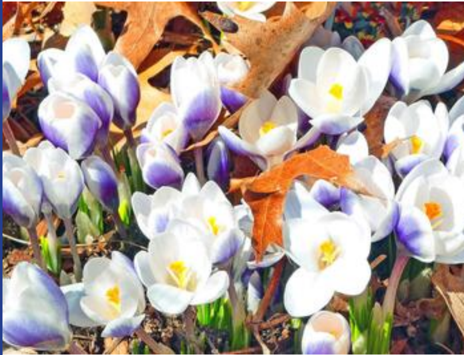
Welcome Spring! Crocus near Mousam Way Trail

Send your photo for consideration to submissions@sanfordspringvalenews.com