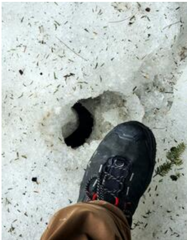
It's best to stay off the ice this time of year.

You'll see people testing their luck ice fishing, skating, even snowmobiling well into March. The problem? The ice doesn't fail gradually. It fails catastrophically. One second, you're on top, the next you're in, and spring water is brutally cold. As you plunge into the dark water below, the cold takes your breath away instantly. Many people drown as they gasp for their breath. Within seconds, cold shock starts to take over your body. As blood rushes away from your extremities to keep your core warm, you