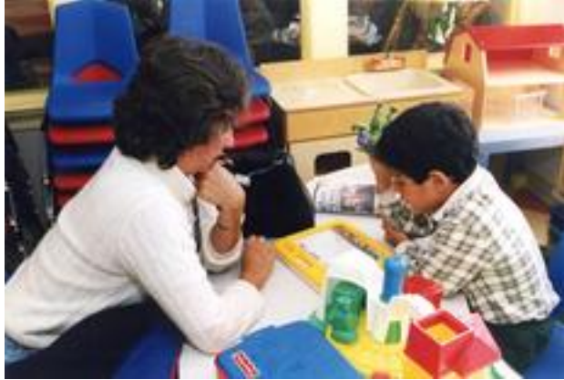
An early childhood educator works one on one with her student.

Professional development for early childhood educators: Thriving with Intention, the York County Conference for Early Childhood Educators, will be held on April 26, from 8 am to 3:30 pm, at Sanford Regional Technical Center, 100 Alumni Blvd., Sanford. The conference will include a keynote speaker, breakout sessions, networking and lunch, with more than 20 vendors represented. FMI, email fccam.professionallearning@gmail.com . To register for the conference, go here: https://tinyurl.com/ycxnzzkd