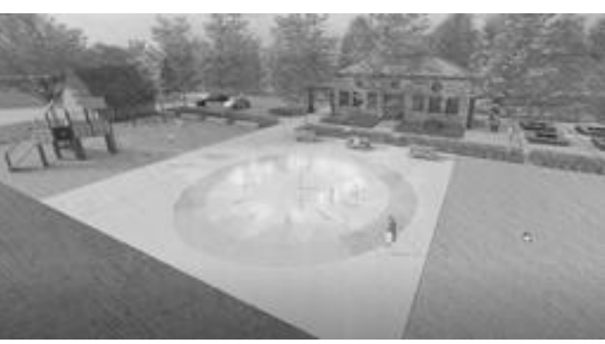
An artist's drawing shows the new splash pad at Carpentier Park.

In addition to the splash pad, the upcoming renovations will include new construction or renovation projects aimed to accommodate patrons of the park, such as reconfigured seating, parking and added handicapped accessible ramps. New atmospheric and utility features