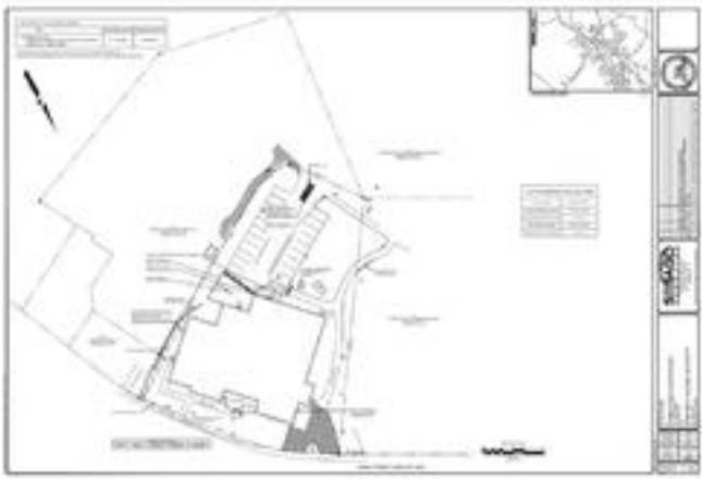
A site plan shows how the former Springvale District Courthouse will be developed as senior housing.

Hanson Ridge housing: The board rejected a proposed zoning change from Residential Development to Urban for land along Hanson Ridge near Route 202 to allow for the use of private sewerage systems and construction of two single-family homes. Board members were concerned