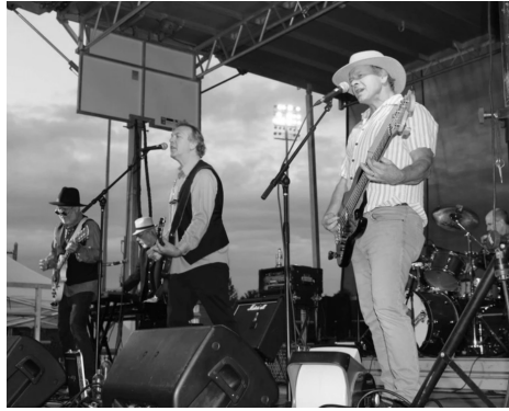
Experience the magic of Tom Petty music live at The Runway

The event aims to bring together fans of all ages to celebrate the enduring legacy of Tom Petty. With a setlist that includes classics like "Free Fallin'," "American Girl," and "I Won't Back Down," attendees can expect a night of sing-alongs and unforgettable moments. The Runway, an open air covered pavilion right on the Sanford Seacoast Regional Airport is