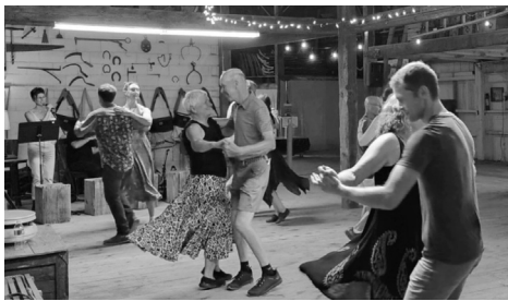
Dancers whoop it up at the Raise the Roof contra dance, held July 27 in the historic barn at McDougal Orchards.

Reap the fruits of your labor and kick up your heels: To celebrate the Aug. 10 opening of its u-pick season for apples and peaches, McDougal Orchards is hosting an Orchard Party on Aug. 15 from 9 am to 6 pm at 201 Hanson Ridge Rd. in Springvale. Orchard tours, a trail walk, a wagon ride and other activities are scheduled. Following the day-long event, the second Raise the Roof contra dance will be held from 6:30 pm to 8:30 pm. The dance will feature caller Hannah Chamberlain and music from the Better Late Than Never band. Food and beverages will be available from Stop Drop N' Roll food truck and The Gin Tin mobile bar. In addition, anyone making canned food or financial donations benefiting the Sanford Backpack Program will be entered into a raffle for a gift basket.