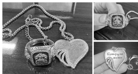
This necklace, displaying a U.S. Navy ring and a heart pendant, was found at Holdsworth Park in early August. The City of Sanford wants to reunite it with its owner.

County taxes taking a hike: The City of Sanford's $967,000 tax bill from York County government is up 9.6 percent from last year, according to the tax commitment approved by York County Commissioners last month. Commissioners say the increase is due to weaker than anticipated revenue from other sources and inflation. The state also increased valuations of most municipalities to keep up with market values. The county tax funds the county jail and sheriff's department, district attorney's office, registries of deeds and probate and more. The tax is assessed on towns and cities according to the overall value of property in each community. Sanford's share is eighth among the county's 29 municipalities. The county tax represents 2.44 percent of the property taxes paid by individual homeowners in Sanford, according to county figures. Tax payments are due Sept. 1, with interest charged after Oct 1.