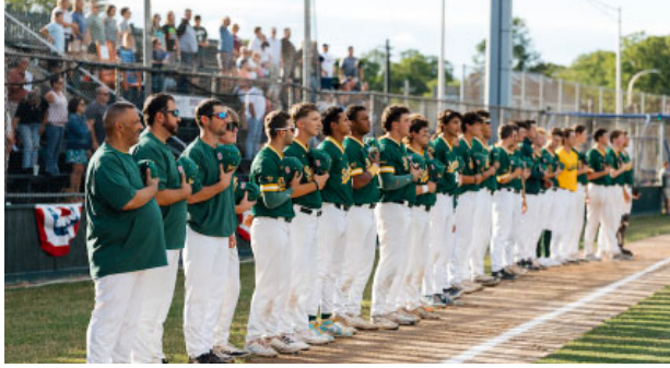
The Mainers fell to the Newport Gulls in the championship series of the NECBL playoffs