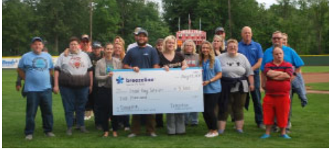
Breezeline staff presented a check to Great Bay Services staff and participants at the last Sanford Mainers' game of the season.