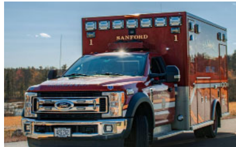
Ambulance 1 is the primary ambulance out of the Springvale Station.

Congresswoman Chellie Pingree's office contacted the Sanford Fire Department (SFD) on Aug. 7 with news that SFD has been awarded a grant through the Assistance to Firefighters Grant program. The grant, amounting to $422,727 according to the FEMA website, will fund 90 percent of the cost for an additional ambulance. The grant helps firefighters and other first responders obtain critically needed equipment, protective gear, emergency vehicles, training and other resources necessary for protecting the public and emergency