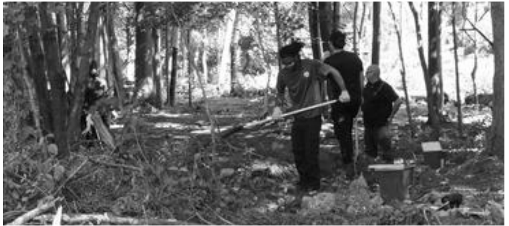
Trauma Services personnel cleaning up the former encampment at Heritage Crossing.

The second cleanup session was done July 8-10 by contracted professionals from Trauma Services, who handpicked remaining materials from underbrush, around trees and scattered throughout the area.