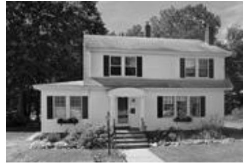
28 Bradeen St., Springvale (7/12 closing date, listed below)

6/28, 1 Rock Pond Rd., #1 , 6-room Cape-style condominium, 3 bed/2 bath, end unit, open concept kitchen and living room, bedroom on first floor, bonus room over garage, laundry on second floor, slab, attached 1-car garage, patio, built in 2024, $409,900