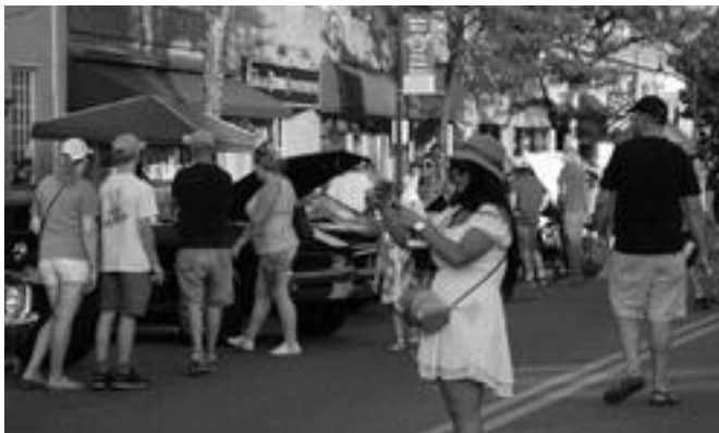
Last year's car show