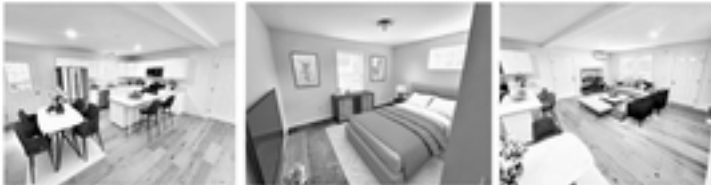
ROCK POND ESTATES — SANFORD STAND ALONE, DUPLEX & BASEMENT UNITS AVAILABLE

Lovely two story townhouse style condos offering 3 bedrooms including master bedroom with en suite bath, open concept kitchen, dining and living room area, granite, plank flooring, contemporary finishes, one car attached garage and heat and AC. PRICES STARTING AT $389,900 for duplex units