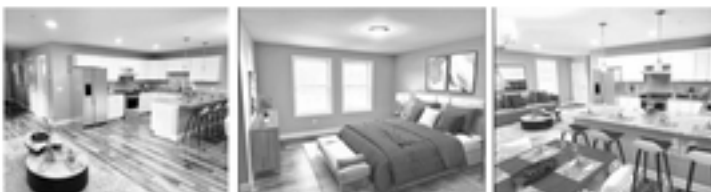
HILLSIDE CROSSING — SPRINGVALE BASEMENT & DAYLIGHT BASEMENT UNITS AVAILABLE

Lovely two story townhouse style condos offering 3 bedrooms including master bedroom with en suite bath, open concept kitchen, dining and living room area, granite, plank flooring, contemporary finishes, one car attached garage and heat and AC. PRICES STARTING AT $389,900 for duplex units