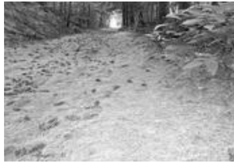
White pine needle disease is evidenced by the yellow/brown needles along Sanford's Rail Trail. Also notice the remnants of last year's mast year of pinecones.

But there are many other causes for premature needle drop on our pine trees. Climate change is causing a condition in our white pines' soil. The