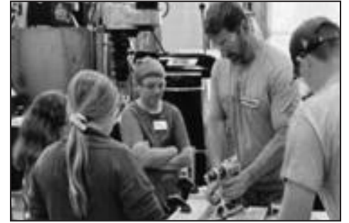
Summer Camp 2024 at SRTC

SRTC campers explored new interests, made new friends: Summer Camp 2024 at the Sanford Regional Technical Center welcomed middle school campers from Kennebunk, Kittery, Marshwood, Massachusetts, Noble, Sanford, Wells and York the last week of June to learn about the center's Career and Technical Education programs. Campers chose from seven different options: plumbing, carpentry, aviation, digital design, early childhood education, law enforcement and fire-fighting. Throughout the week, campers engaged in practical activities and learned valuable skills related to their chosen programs. The hands-on approach allowed students to gain insight into these professions and sparked curiosity about potential future careers. One of the camp highlights was the chance for students to make new friends from different schools in the area.