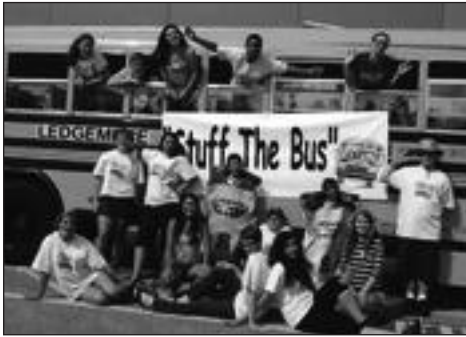
Stuff the Bus Maine is seeking donations for the new school year.