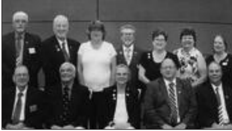
Sanford Elks Lodge #1470 Ritual Team.

Elks shine in the Lone Star State: Congratulations to the Sanford Lodge #1470 Ritual Team for finishing fourth in the nation in the 2024 Grand Lodge Ritual Contest. The Elks Grand Lodge Convention was held in Austin, Texas, from June 30 to July 3. The Sanford team qualified for the national competition in Feb. 2024 by earning the top spot in the Maine Elks Association State Ritual Contest.