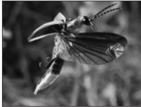
The common eastern firefly, or big dipper

Our fireflies came from the south, modern-day Texas, about 5 to 25 million years