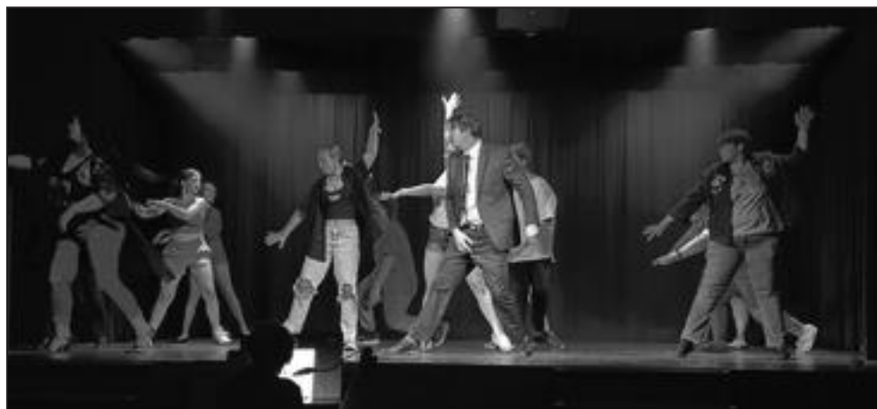
Cast and crew of “ The Addams Family ” prepare for a frightfully delightful performance.