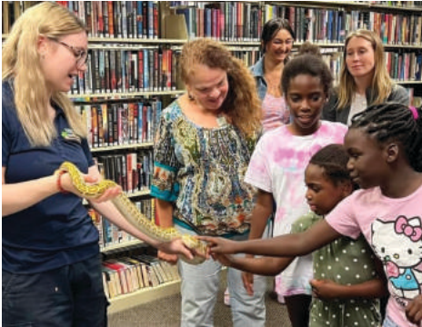
Photo: Children step out of their comfort zone at Goodall Library's Summer Reading Program event.

Tickets are $20 per person; children under age 12 are free. This is the first in a series of events to help the orchard fund their new barn roof. FMI and tickets, go to McDougalOrchards.com .