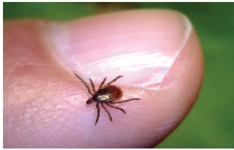
An adult female deer tick

Powassan virus is rare, with about 20–50 cases reported per year across the country from 2018–2023. Maine identified a record number of seven cases of Powassan in 2023 and has record-