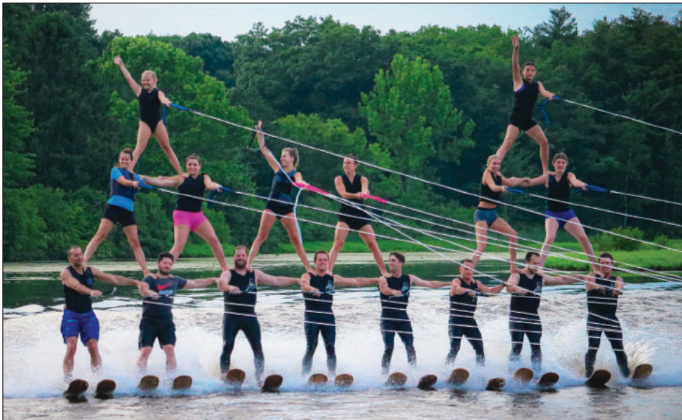
Members of The Maine Attraction Water Ski Show Team rehearse a triple pyramid on Number One Pond.

Copyright © 2024 - Sanford Springvale News - All rights reserved