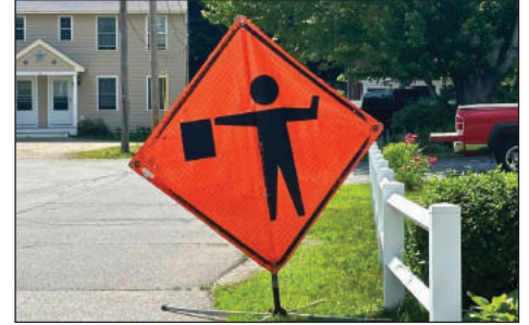
Some of the many roadway construction signs seen around Sanford/Springvale.